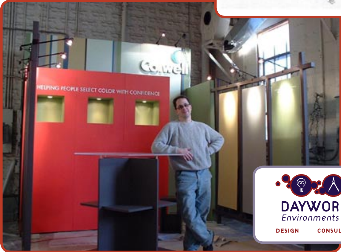
The booth ready for inspection at our shop before we broke it down and shipped it to Las Vegas for the Builders Show.