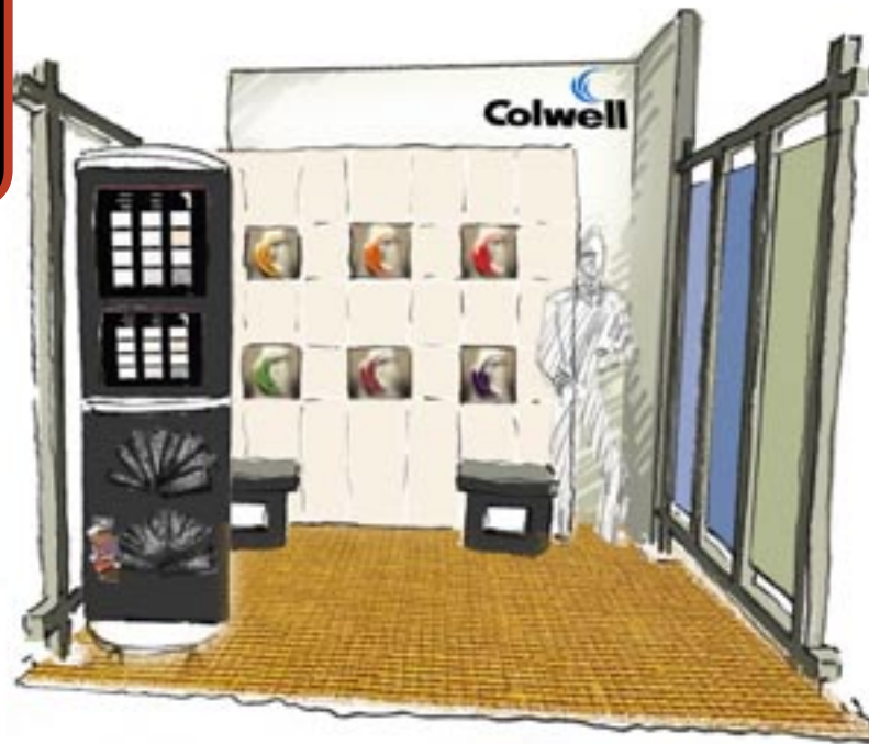
The early proposal: This helped Colwell begin to visualize their booth and how they would use it.

Colwell, an international color management company wanted to experiment with a presence at the Builder's Show in Las Vegas. They had a small booth space and were unsure about whether they would keep attending more trade-shows like this. As a result they were reluctant to go to a large full-service display company. After a few informational meetings with us they felt comfortable enough to go forward with a design/build.